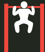
Extreme Functional Training